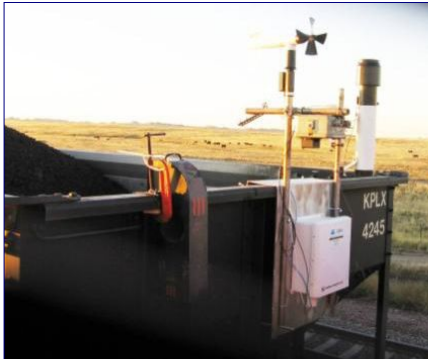
Rail Transport Emission Profiling System (RTEPS)